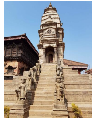
Siddhi Lakshmi temple