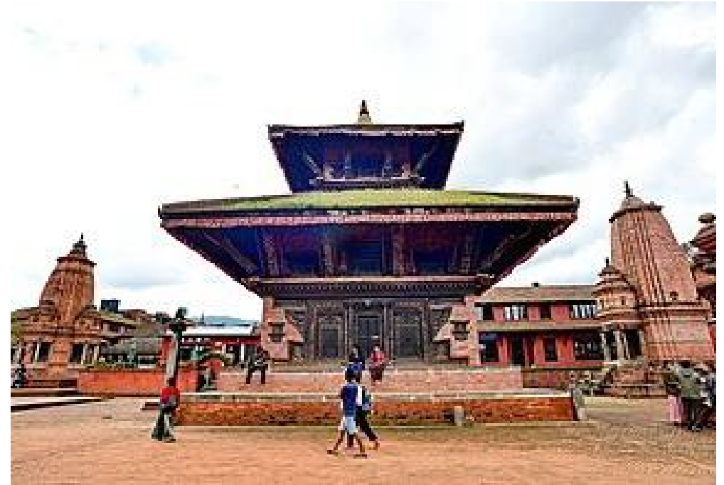
Kedarnath temple (left), Badrinath Temple (right) Gopinath Krishna Temple (middle)