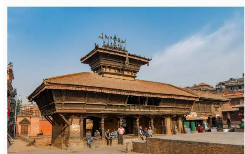
Bhimsen Temple and dabali