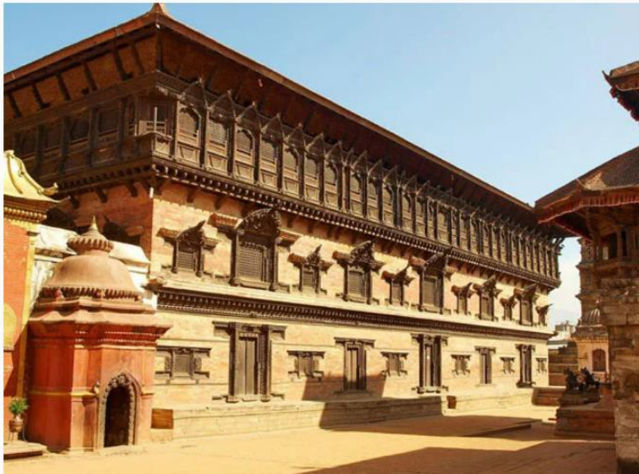
55 window palace