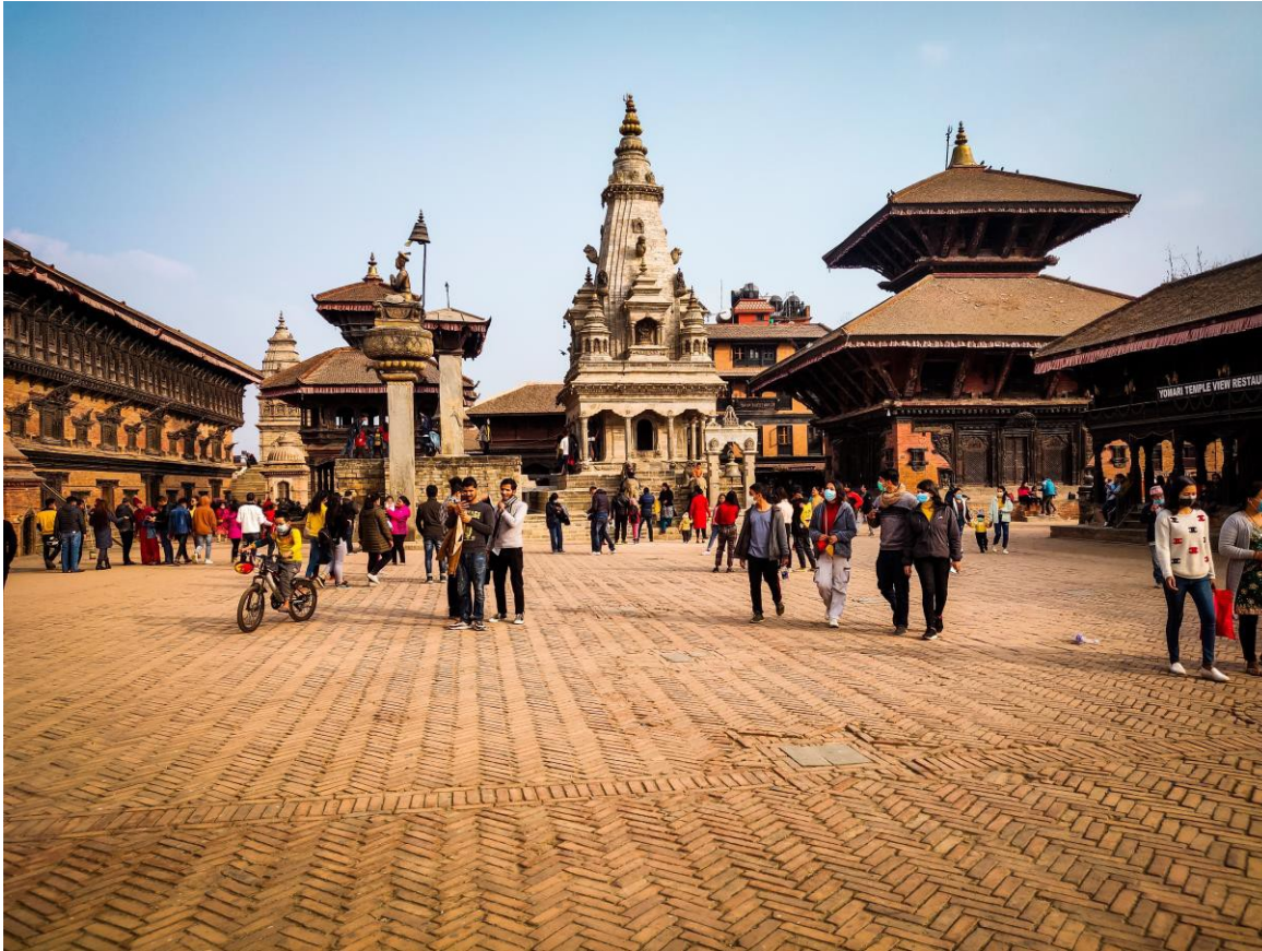
Bhaktapur Durbar square